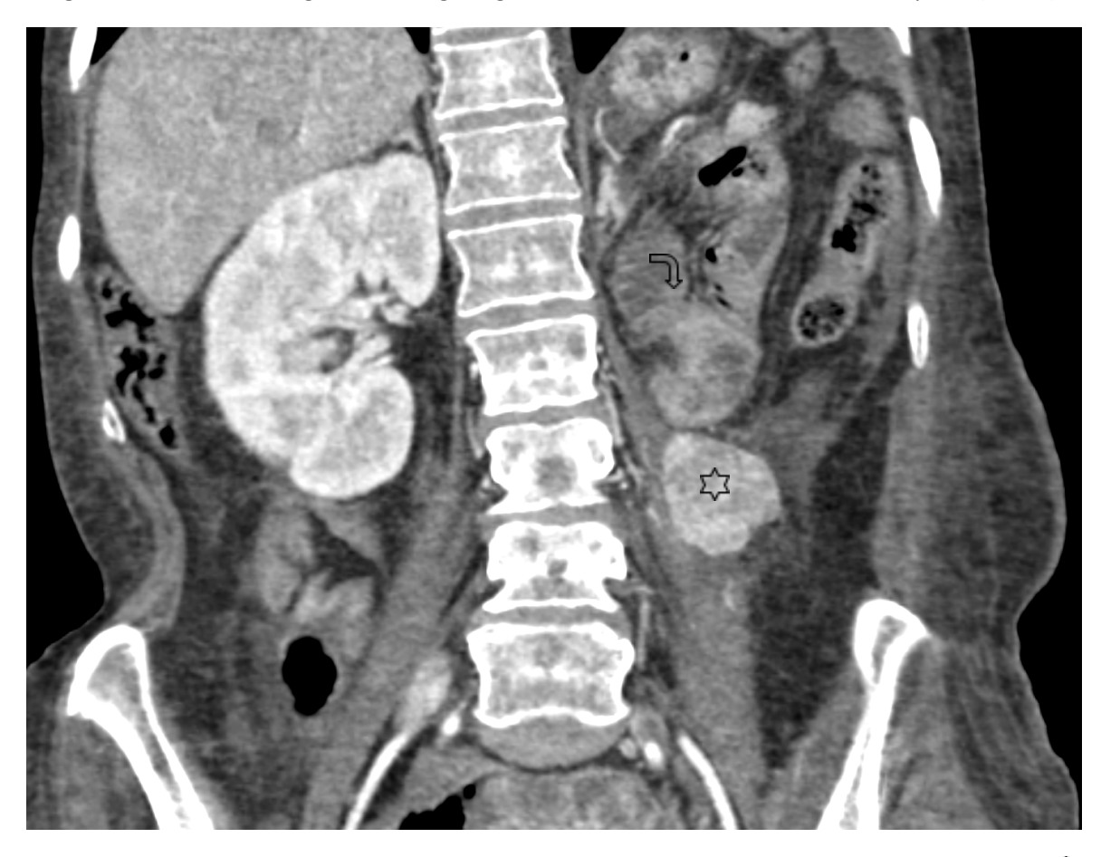
Figure 4. Coronal CECT image reveals an enhancing solid lesion infiltrating the left psoas muscle ( \bigcirc ). Absence of left kidney is also noted ( \bigcirc ).