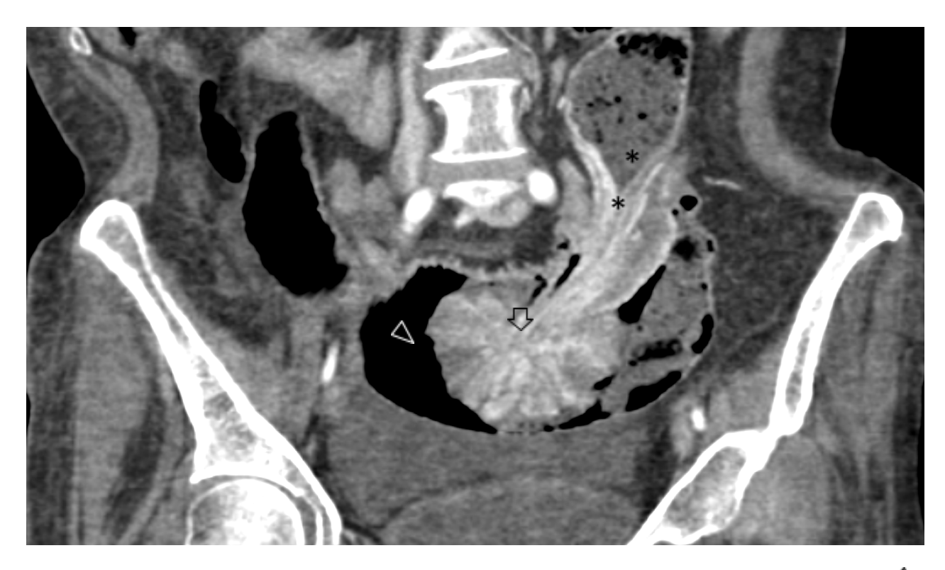
Figure 2. Coronal CECT image shows an enhancing polypoid mass (♣) protruding into the ileal lumen ( △) with associated telescoping of the proximal ileal loop (★) giving an appearance of bowel within bowel, consistent with and ileo-ileal intussusception